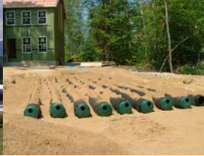
Enviro-Septic® in LEED Home