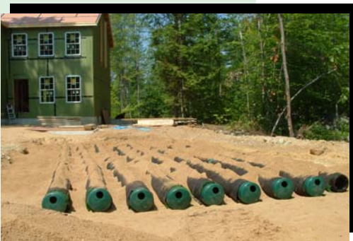
Enviro-Septic® Installation at LEED Certified Home

Presby Environmental was proud to be a part of the second Leadership in Energy and Environmental Design (LEED) residential home built in the state of New Hampshire, this past fall. This “green” home, located in Loudon, was awarded a LEED Silver certification, the second highest rating granted by this distinguished organization. Zetland Homes, Inc., a construction company located in Hopkington funded the project largely out-of-pocket and needed the support of other eco-friendly companies to help make the project a reality. Presby Environmental donated an Enviro-Septic® System to the LEED demonstration home that was created in part to raise awareness about green building with conventional materials. The debut of the LEED home was a huge success, with over 1,000 people touring the home between October and November. The home was even (Cont. on Pg. 3)