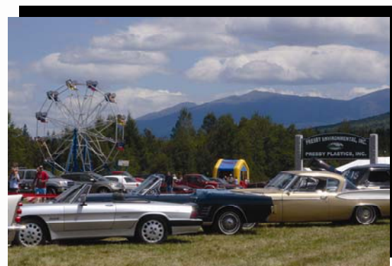
Picture taken at last open house in 2005