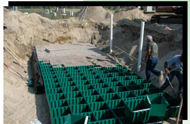
De-Nyte™ Installation at Massachusetts Alternative Septic System Test Center

Presby Environmental's De-Nyte™ denitrification System was issued a patent from the United States Patent and Trademark office last October. A concept that has undergone nearly five years of testing and development, the De-Nyte™ System has been awarded this patent based on the system's unique and innovative design. In fact, De-Nyte™ is the only denitrification system on the market today that is passive, affordable and made for residential and commercial applications. The De-Nyte™ System was developed to work exclusively with the Enviro-Septic® Wastewater Treatment System to treat harmful nitrates in leachate. In high concentrations, nitrates can cause harm to animals, humans and the environment and have been linked to certain types of cancer. Testing at the Massachusetts Alternative Septic System Test Center has shown that De-Nyte™ is successful at treating nitrate levels better than what is required by EPA drinking water standards. Testing is ongoing at this facility in order to perfect the System's ability to treat these nitrates. De-Nyte™ is currently available in New Hampshire and Maine. Anyone interested in having a De-Nyte™ System installed needs to work directly with Presby Environmental. Please contact Presby Environmental for more information.