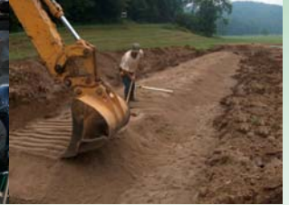
Ohio Concurrence Approvals