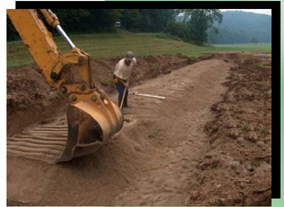
Enviro-Septic® Installation in Indiana