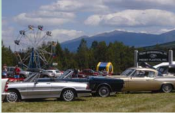
Open House 08'

Read about these stories and more inside